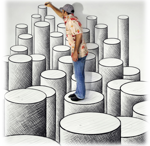
Above: an artist completes a large-scale illusion drawing. Below: examples of photo-realistic 3D illusion paintings by instructor Amy Gibson

This camp is perfect for the beginning art student who wants to gain a firm foundation in drawing and understanding color.